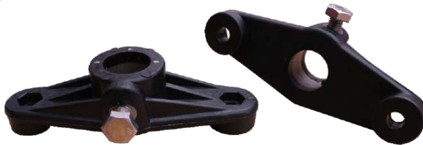
ENGINEERING NYLON FLANGE