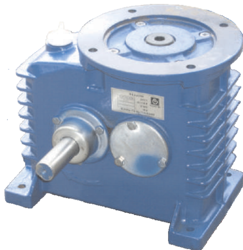
(1HP/2HP, d 25MM, 1:14)