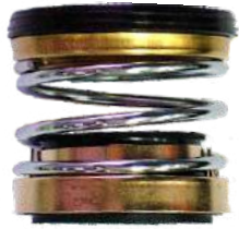
減速機專用機械軸封 MECHANICAL SHAFT SEAL FOR REDUCER