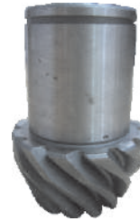
SMALL ARCKED GEAR