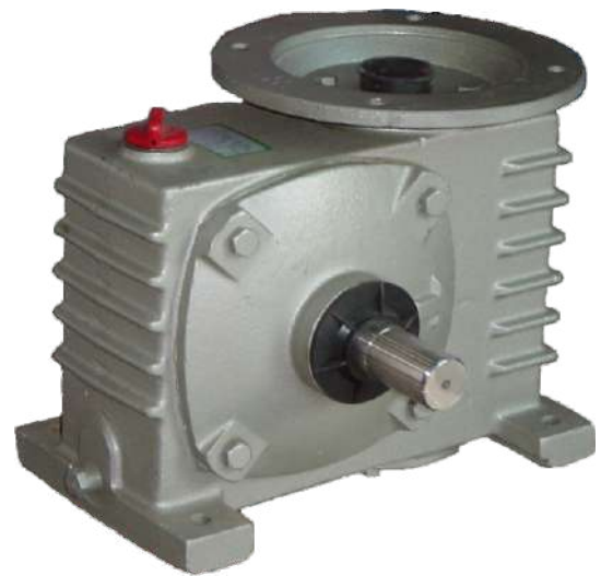
WATERTEK T90S (3HP, d 28MM)