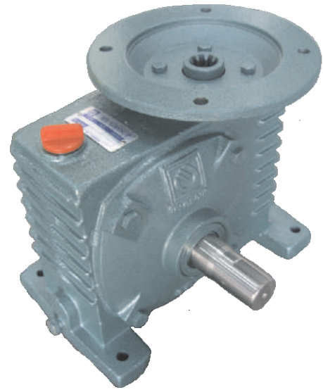
HYG T80-2 (2HP, d28MM)