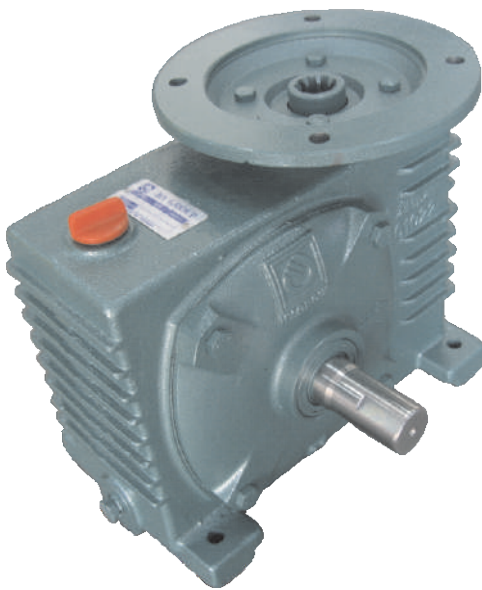
HYG T90 (3HP, d28MM)