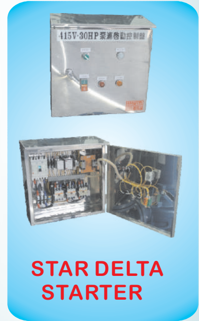
STAR DELTA STARTER