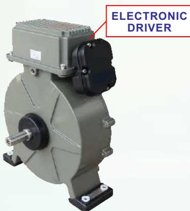
無刷直流馬達 BLDC MOTOR