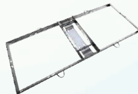
不鏽鋼機架 SS COMMON BED