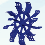
工程尼龍葉輪（銅套） BLUE ENGINEERING PLASTIC 16-BLADE IMPELLER NO.1816 (CU BUSH d25.5mm)