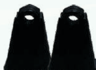
小滾柱塑料支撐座 SMALL ROLLER SUPPORTER