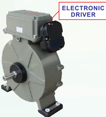
無刷直流馬達 BLDC MOTOR