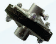
圓形不鏽鋼活動接頭 STAINLESS STEEL ROUND MOVEABLE CONNECTOR