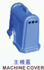
主機蓋 MACHINE COVER