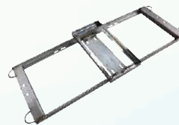
不鏽鋼機架 SS COMMON BED