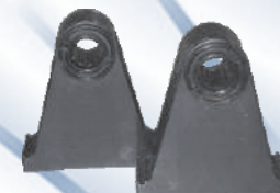
小滾柱軸承座 SMALL ROLLER SUPPORTER