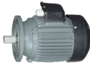
高效率馬達T100-3 ANA HIGH EFFICIENT MOTOR T100-3