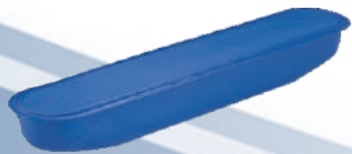
精密度聚乙烯塑鋼長浮船 HDPE LONG FLOATER