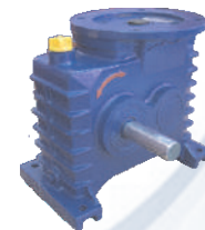
弧形傘齒輪減速機T85 ANA BEVEL GEAR REDUCER T85 (d 25MM, 1:14, 1:16)