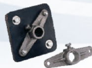
不鏽鋼活動接頭 SQ STAINLESS STEEL MOVABLE CONNECTOR