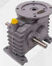
U2 CI BEVEL GEAR REDUCER T85 (d 25mm, 1:14, 110mm)