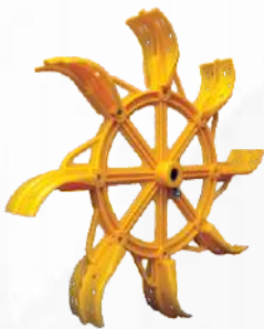
S2 YELLOW PLASTIC WEBSPIRAL IMPELLER NO.6A (CU BUSH d25.5mm)