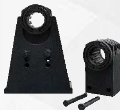
ADJUSTABLE SMALL ROLLER SUPPORTER (d 25.2 x 110mm)