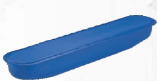
HDPE PONTOON FLOATER S4