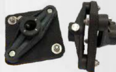
BLACK EN PLASTIC MOVABLE CONNECTOR MC-04 (d 25.5 x 25.5mm)