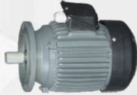
ANA MOTOR T100-3