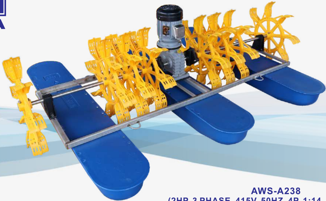
AWS-A238 (2HP, 3 PHASE, 415V, 50HZ, 4P, 1:14, 120MM, 2.2A)