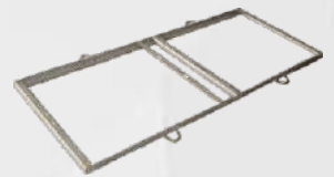
SS304 COMMON BED (L1560 x 725MM)