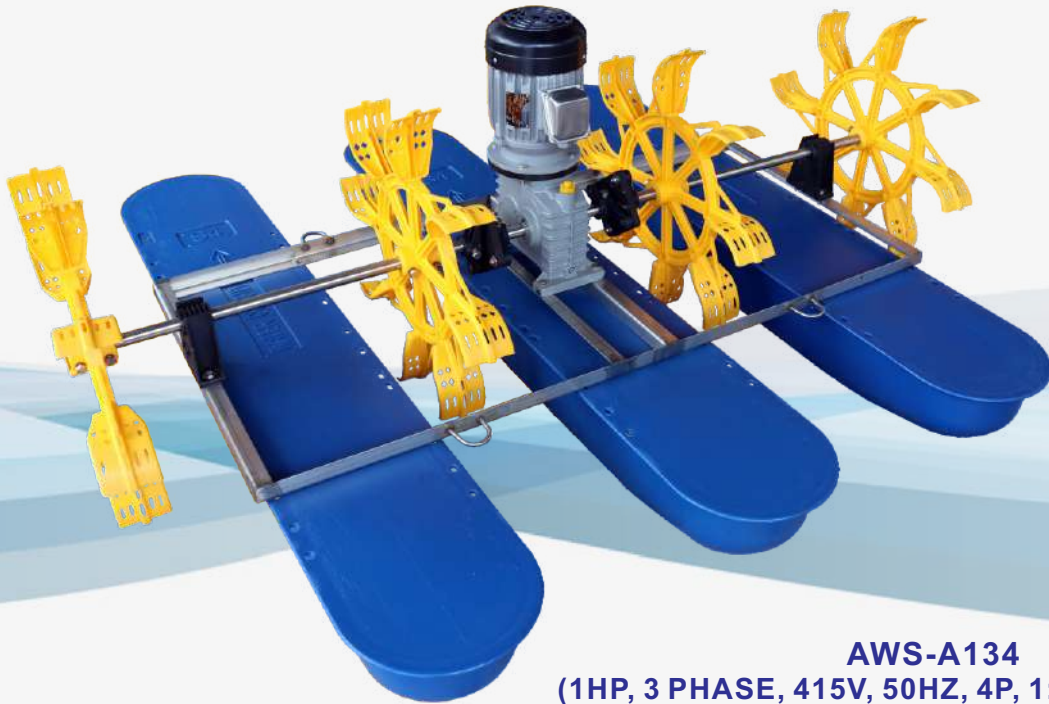
AWS-A134 (1HP, 3 PHASE, 415V, 50HZ, 4P, 1:14, 110MM, 1.1A)