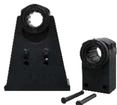
ADJ SMALL ROLLER SUPPORTER (d25.2mm x H110m)