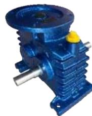
HIGH SPEED BEVEL GEAR REDUCER (d28mm x H110m)