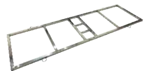
SS SQ PIPE COMMON BED (L2500 x 725MM)