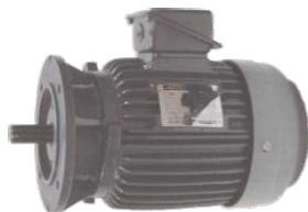
HIGH EFFICIENCY INDUCTION MOTOR