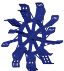
16-BLADE PLASTIC IMPELLER NO.1816