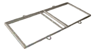
N-TYPE SS COMMON BED (L1675 x 725MM)