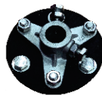
ROUND STAINLESS STEEL MOVABLE CONNECTOR (d28.5 x 25.5mm)