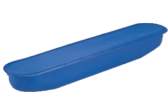
HDPE LONG FLOATER (1750m)