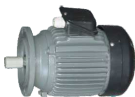
HIGH EFFICIENCY INDUCTION MOTOR